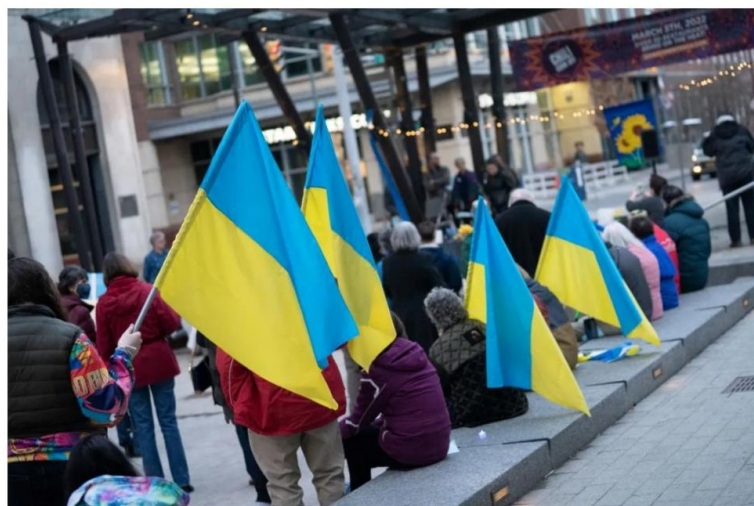
Flags at the pro-Ukrainian rally on the Commons on March 24.