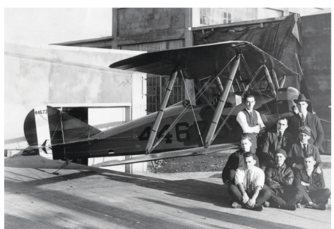
The History Center in Tompkins County, Thomas-Morse Factory Workers in 1918