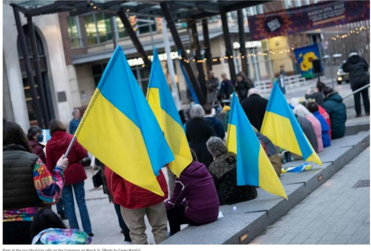
Flags at the pro-Ukrainian rally on the Commons on March 24.